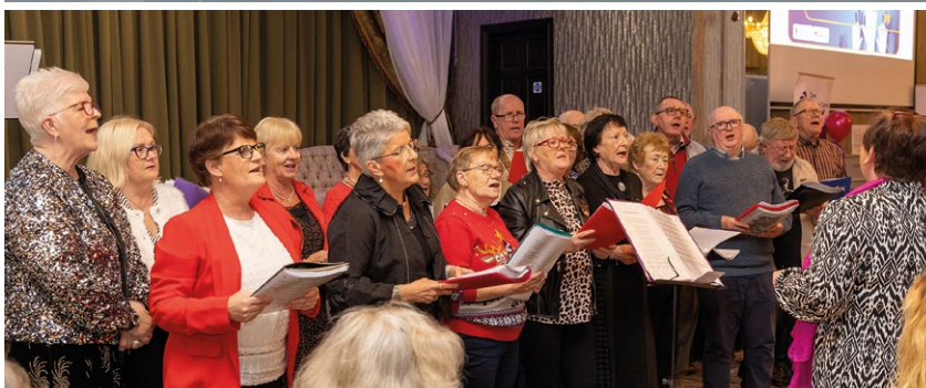
The St Michaels Villa Community Choir performing at the Volunteer Recognition Event